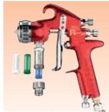
Optional accessory VSA-512 St/St Fluid Filter Kit (inc. 3 elements)