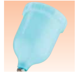
Gravity cup (Blue polyester) pt. no. GFC-511 for difficult fluids.