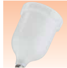
Gravity cup pt. no. GFC-501