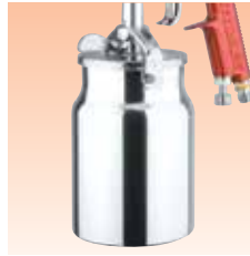
Suction cup pt. no. KR-566-1-B

JGA and GFG PRO spray guns are packaged as pressure gun only, suction gun kit includes 1 litre cup and gravity kits include the 568 ml standard gravity cup.